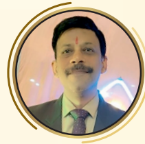
Mr. Rohit Sharma