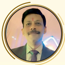
Mr. Rohit Sharma