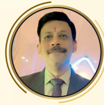
Mr. Rohit Sharma